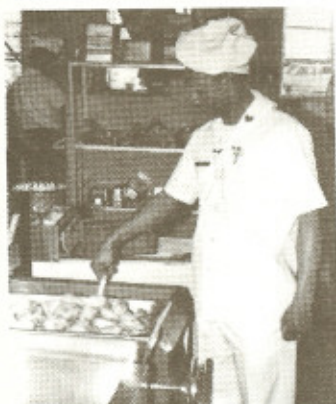
Excellent progressive cooking techniques.....