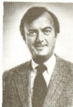
National Restaurant Association