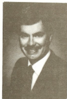
National Restaurant Association