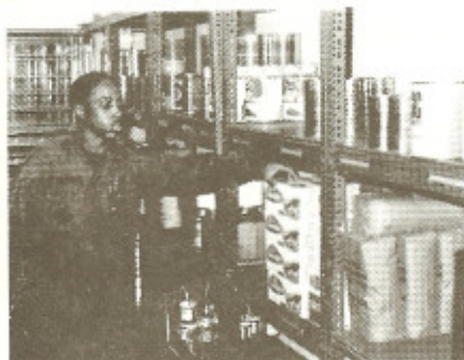
and detailed attention to storage and inventory....

made George AFB the multiple unit category runner-up.