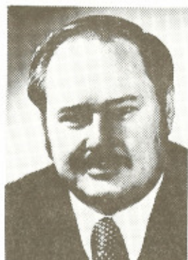
CHAIRMAN OF THE BOARD & PRESIDENT