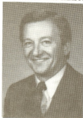
Society for Foodservice Management