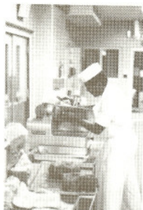
coupled with outstanding portion control techniques.....