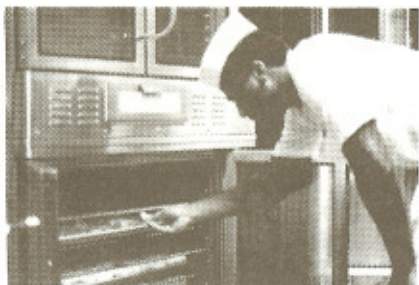
Adherence to standard recipes.....