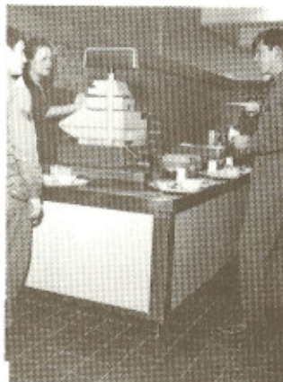
along with customer courtesy.....