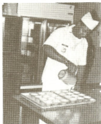
coupled with strict adherence to standard recipes.....