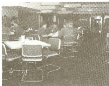
Pleasant dining atmosphere.....