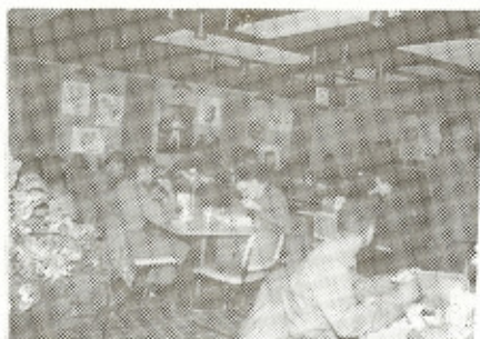
and providing hot nutritional meals.....