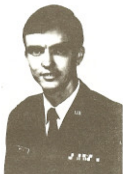
HQ USAF Engineering & Services Center