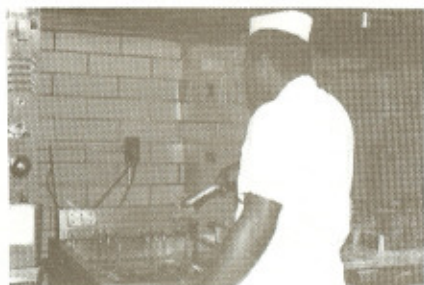
and excellent maintenance of equipment.....

contributed to the outstanding food service program of the single unit category runner-up.