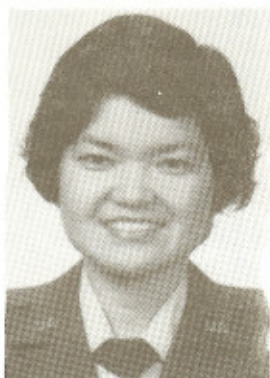
HQ USAF Engineering & Services Center