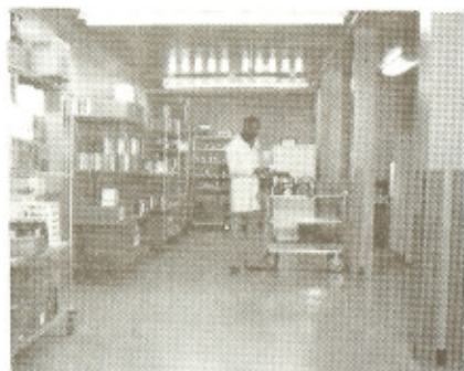
and excellence in inventory and storage practices.....