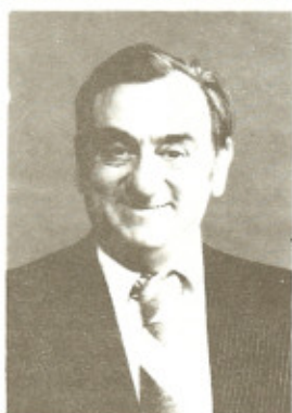
International Food Service Executives Association