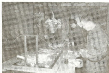
with a wide variety of salads and pastry.....

helped Chanute AFB soar to the top as the 1984 multiple unit category winner.