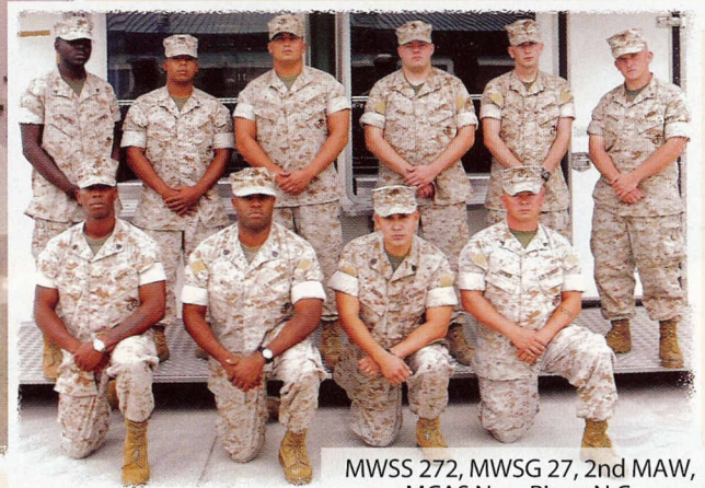
MWSS 272, MWSG 27, 2nd MAW, MCAS New River, N.C.