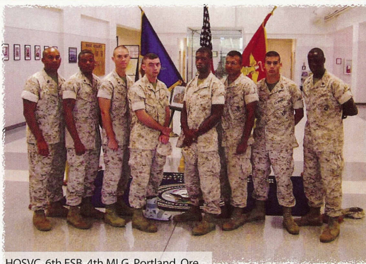
HQSVC, 6th ESB, 4th MLG, Portland, Ore.