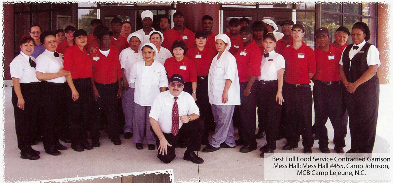
Best Full Food Service Contracted Garrison Mess Hall: Mess Hall #455, Camp Johnson, MCB Camp Lejeune, N.C.